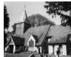
All Saints Church